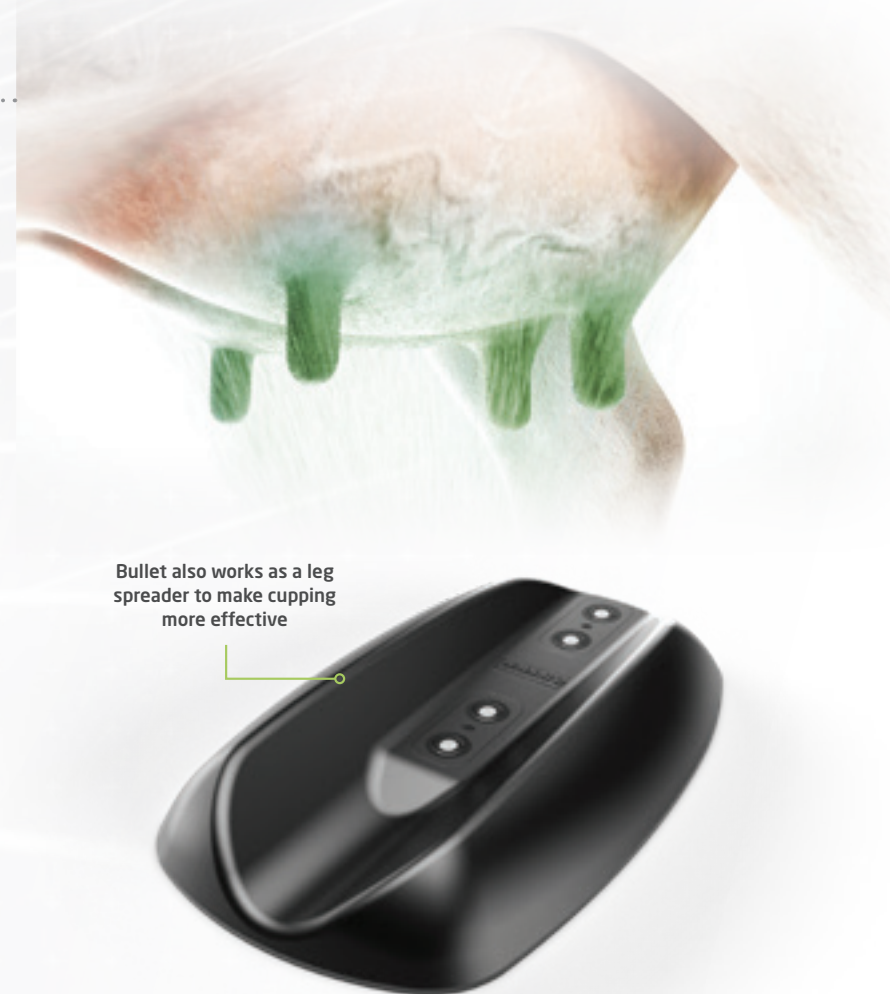
Bullet also works as a leg spreader to make cupping more effective

Pre-milking option A pre-milking spray option is available, which reduces labour.